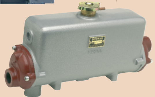
Header Tank Heat Exchanger